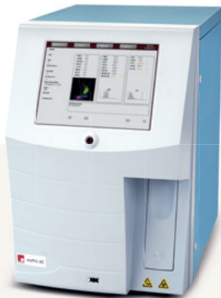
Mythic 60 1) 5+ DIFF TECHNOLOGY