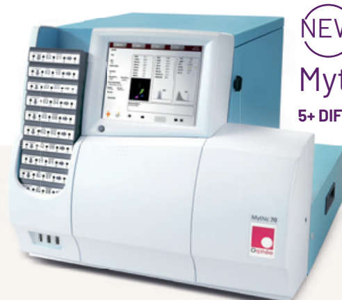
NEW Mythic 70 1) 5+ DIFF TECHNOLOGY