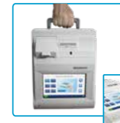
Portable and lightweight